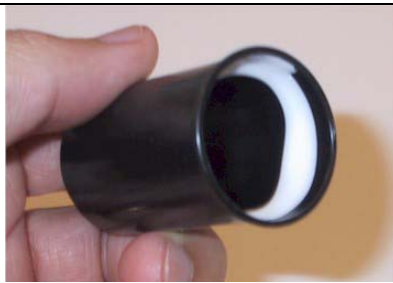
Prep the film canister with lotion (not shown, wrap a reversed layer of tape around the outside of the barrel)