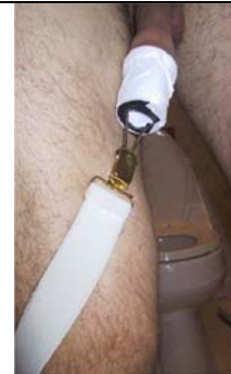
Tugging clip - close-up (don't apply tension until the tape has had 10 minutes to set)