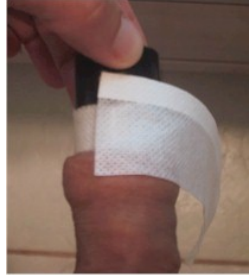
Note the skin rolled up onto the reversed tape, and the outer tape sticking to inner tape and skin