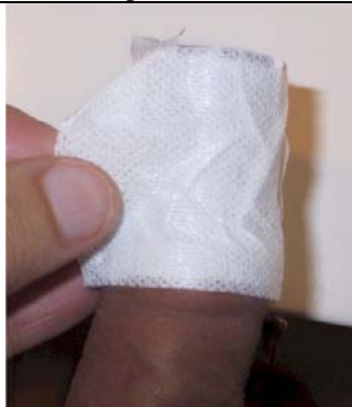
Finish wrapping the tape and press into place