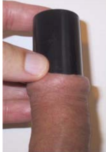
Pull some skin up (reversed tape not shown)