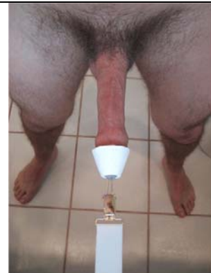
Penis w/TLC Tugger Affixed