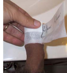
Finish the first wrap with backing still partly in place