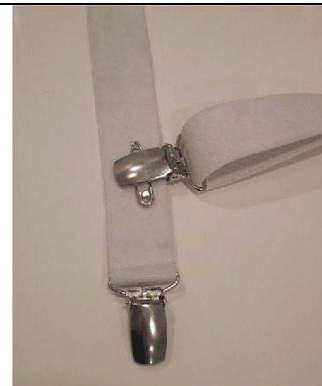
Strap showing pin at clipping point