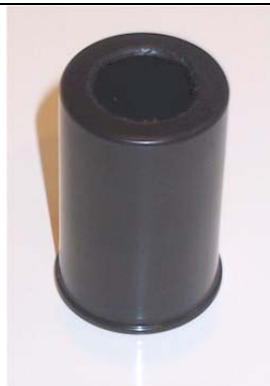
A cut-out canister