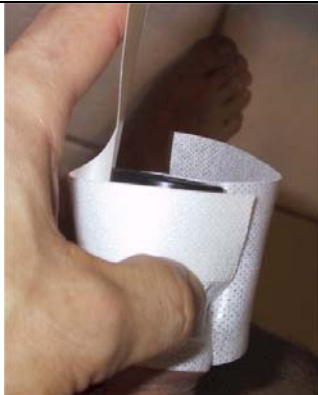
Pull out the remaining backing strip