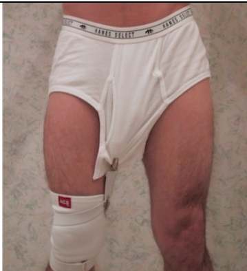
Tugging clipped through loincloth