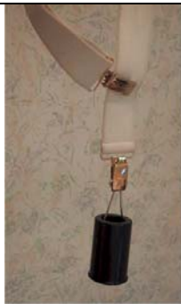
Canister with tugging handle